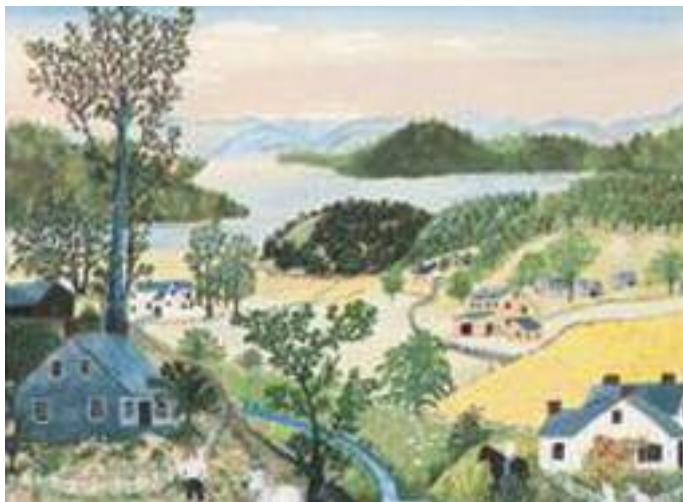
A Beautiful World Grandma Moses

and her work was pursued by collectors. Her work was exhibited in Europe and Japan where it was very well received. She was particularly known as a prolific painter and that approach stayed with her until her death in 1961. It is estimated that she produced over 3600 paintings in her 30 years of painting. Her art, considered “folk art” was