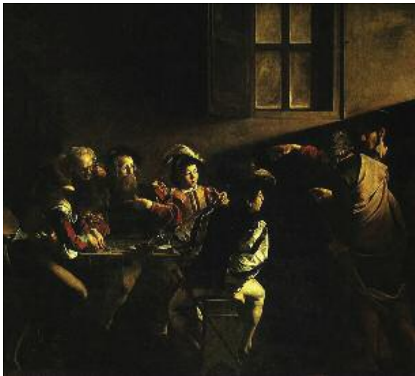
The Calling of St. Matthew Caravaggio

He received training as a painter in Milan under the direction of a "master" who had