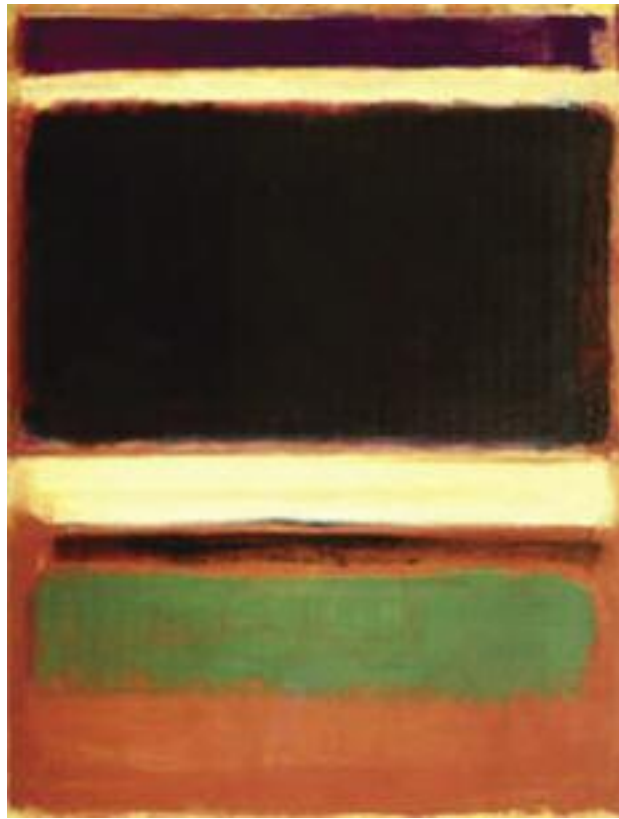
No. 3 Magenta, Black, Green on Orange Marck Rothko

Anna Mary Robertson Moses (September 7, 1860 – December 13, 1961), widely known as “Grandma Moses” is the best known example of an individual who began her pursuit of an art career at a late age. She began painting when in her seventies. Prior to that she had pursued a career in embroidery but had to give it up because of arthritis. Her work was discovered by a collector who saw it in a drugstore window. Following a show in New York, her art began to draw international attention