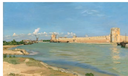
The Ramparts at Aigues-Mortes, by Frédéric Bazille.

February 6, 2017-April 14, 2017 (This exhibition is open 10:00 AM to 5:00 PM Monday through Friday. It is not open on weekends.)