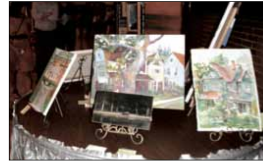
Plein Air paintings