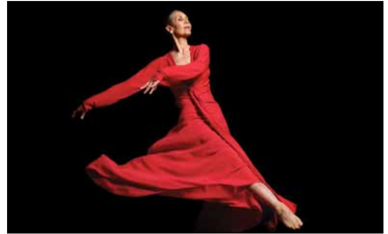
Michele Mattei, Photo of Carmen de Lavallade

1250 New York Avenue, N.W., Washington, DC 20005-3970 202-783-5000, 1-800-222-7270