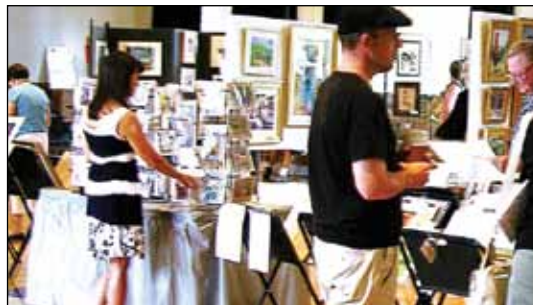
Checking out the cards