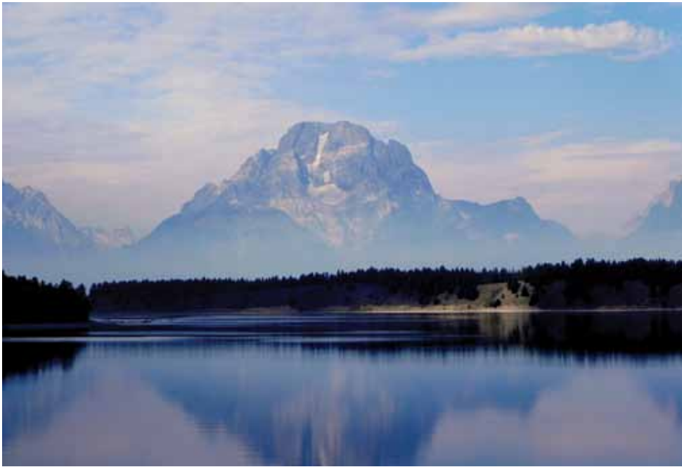
Grand Tetons

Recently, I had the pleasure of visiting two of our great National Parks: Grand Teton National Park and Yellowstone National Park near Jackson, Wyoming. The entire valley is known as Jackson Hole, a fact that I learned while we were there. It is named after David Edward Jackson, a hunter and trapper who explored the area. It was eventually shortened to Jackson Hole as it is known today. If you have never been, I would definitely recommend a painting expedition to see these dramatic mountains and natural wonders. So what does Thomas Moran, the well-known landscape painter have to