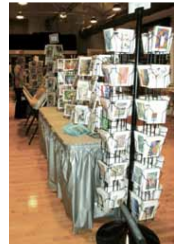
Display at Kensington