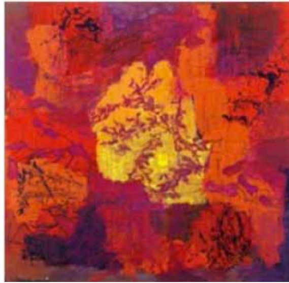
By Per Kirkeby

Cinto's intricate ink and acrylic drawings on canvas pay homage to Arthur Dove (1880–1946) landscapes, also in The Phillips Collection. Like Dove, Cinto combines a fascinating melding of representation-alism and abstract form.