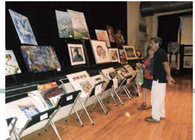
Checking Out The Artwork