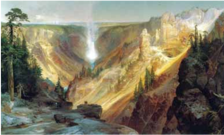
The Grand Canyon of the Yellowstone, by Thomas Moran

Not surprisingly, Moran's devotion to the area also helped raise his stature as an artist and contributed to the beginnings of his financial success. His first large painting, The Grand Canyon of the Yellowstone , was the beginning of the public's fascination with Yellowstone. The painting was eventually purchased by the Federal Government and can be seen at the Smithsonian's American Art Museum. Large paintings by his fellow landscape artists such as Bierstadt are also on view in Washington, DC art galleries. Another of his dynamic paintings, The Three Tetons , is on display at the