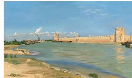
The Ramparts at Aigues-Mortes, by Frédéric Bazille.

Frédéric Bazille (1841-1870) is almost unknown today, but his contribution to the birth