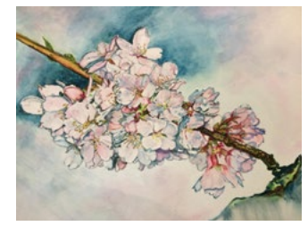
Painting by James Vissari

James Vissari will exhibit landscapes and botanicals in a solo show at Brookside Gardens in September.