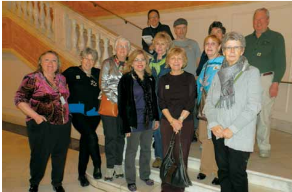
MAA Members At NMWA Tour