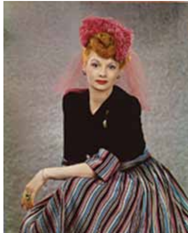
Lucille Ball— In Vibrant Color: Vintage Celebrity Portraits from the Harry Warnecke Studio

8th St. at F St., NW, Washington, DC (202) 633-1000 (voice/tape) The National Portrait Gallery (NPG) and the Smithsonian American Art Museum (SAAM) both contain many permanent exhibits that easily allow for many visits. These two connected galleries, which are part of the Smithsonian