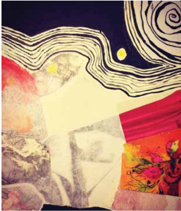
Barbie, by Phoebe O'Dell

If you are interested in having your work included in MAA News , please send one or two high-resolution (300 dpi) jpegs to nmfalk@comcast.net . Please label your submissions with the title and your name.