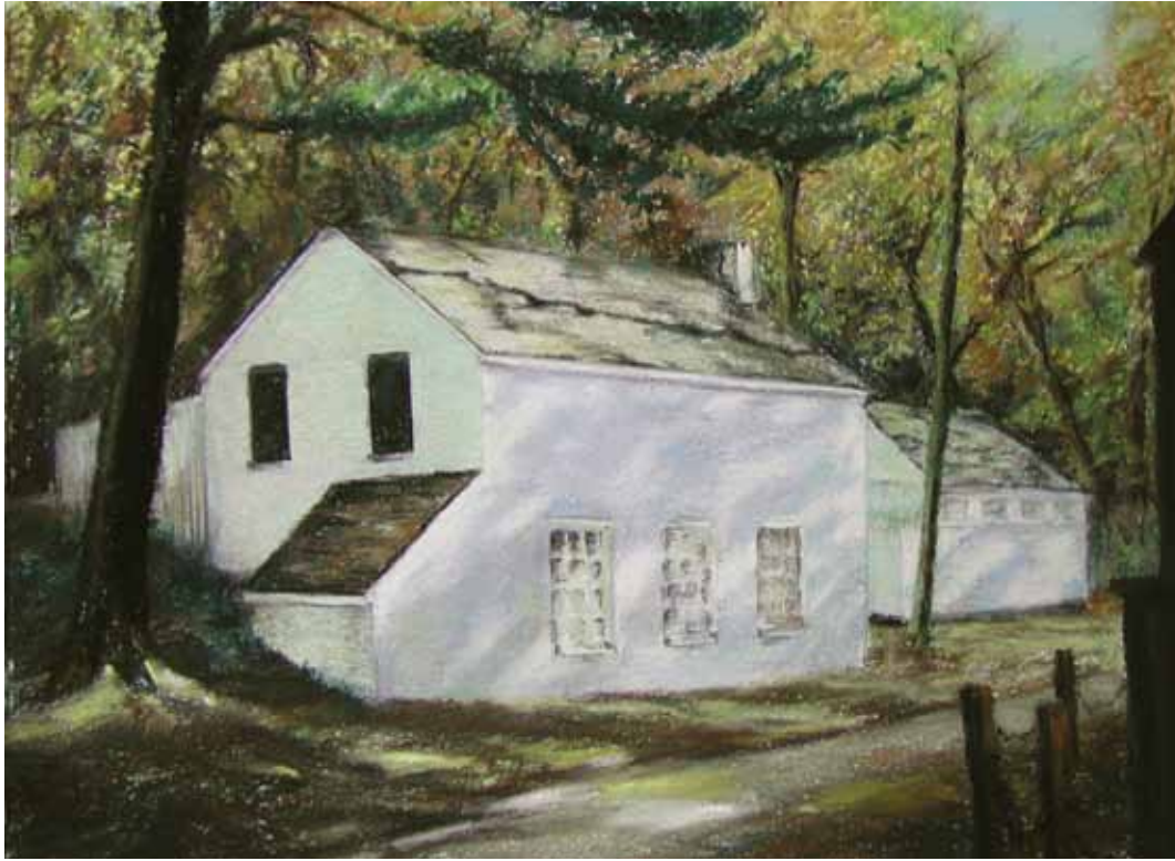
Great Falls Lock House