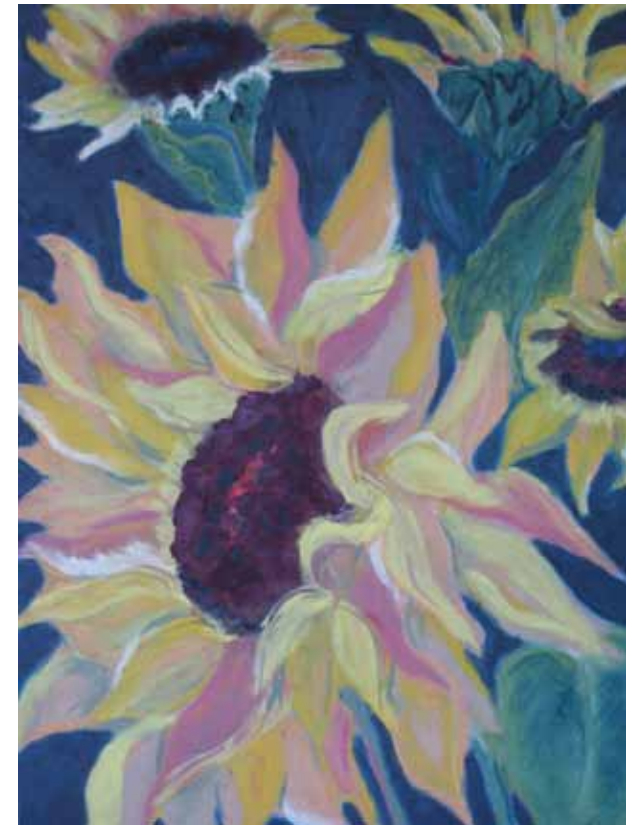
Tournesol, Oil Pastel, by Fleur de Virginie

If you are interested in having your work included in MAA News , please send one or two high-resolution (300 dpi) jpegs to nmfalk@comcast.net . Please label your submissions with the title and your name.