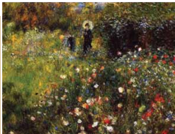
Woman with a Parasol in a Garden, by Auguste Renoir