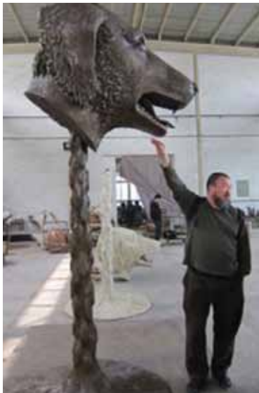
Ai Weiwei with the Dog Head at the foundry in China

The twelve heads represent the Chinese zodiac. Ai was inspired by the a set of eighteenth-century heads from the Qing dynasty originally placed in the Forbidden City's Yuanming Yuan (Garden of Perfect Brightness) but these 10 foot high pieces are most definitely his own vision.