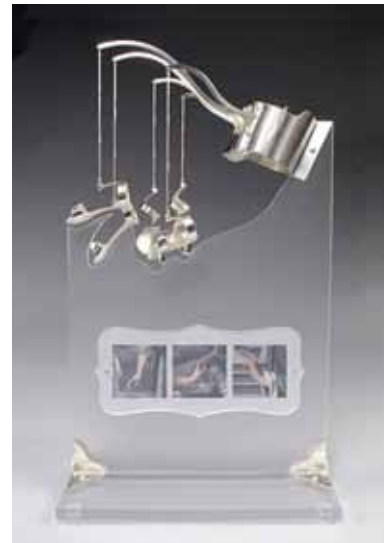
From 40 Under 40

8th St. at F St., NW, Washington, DC 202 633-1000 (voice/tape) The National Portrait Gallery (NPG) and the Smithsonian American Art Museum (SAAM) both contain many permanent exhibits that easily allow for many visits. These two connected galleries, which are part of the Smithsonian Institute, form a national treasure of American paintings and sculpture. The buildings just reopened recently after a nearly 6