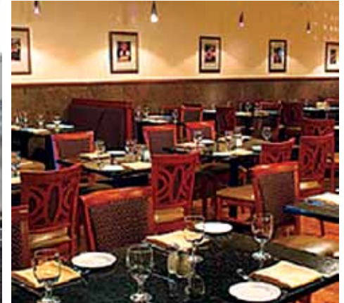
Amici Miei Restaurant in Potomac will be the site of MAA's first special show.

We are pleased to announce a new initiative to provide additional show venues for MAA members. Unlike our larger venues like the Kensington Armory, Friendship Heights Village Center, Brookside Gardens Visitor Center, or the Artistic Gallery, this initiative will focus on finding smaller, more intimate opportuni-