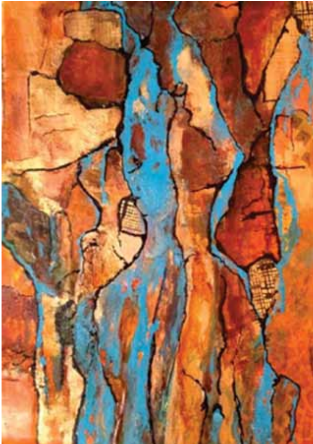
Endless Flow, by Rosemarie DiGregorio