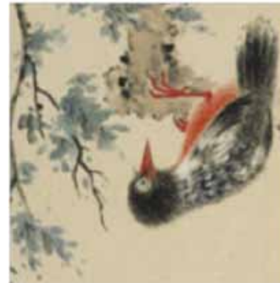
Winged Spirits: Birds in Chinese Paintings

February 23, 2012 to May 13, 2012 Along with a new work by Aitken, which will transform the gallery's façade, this group of works will explore the evolving Light and Space movement of the 1950's through the work of five pivotal Latin American artists: Carlos Cruz-Diez (b. Caracas, Venezuela, 1923), Lucio Fontana (b. Rosario, Argentina, 1899; d. Varese, Italy, 1968), Julio Le Parc (b. Mendoza, Argentina, 1928), Hélio Oiticica (b. Rio de Janeiro,