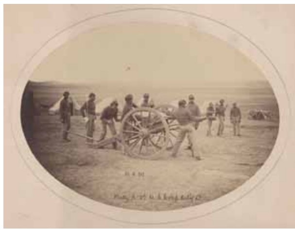
Unknown Photographer: From Shadows of History, The Corcoran

This exhibit is drawn from the Norrell collection and includes some of the most powerful photos taken during the Civil War.