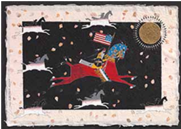
A Song for the Horse Nation

Allow yourself to explore the relationship between Native Americans and horses. This exhibit includes regalia, a 16 foot high Sioux tipi, and paintings from the time of Columbus to modern day.