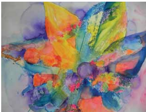
Straight Lines, Curves, and Colors, Michael Shibley

If you are interested in having your work included in MAA News , please send one or two high-resolution (300 dpi) jpegs to nmfalk@comcast.net . Please label your submissions with the title and your name.