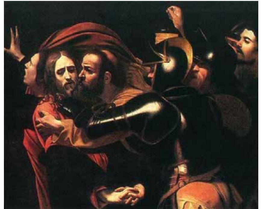
The Taking of Christ , by Caravaggio