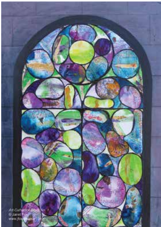
Art Cathedral Glass No. 1, by Janet Fox

If you are interested in having your work included in MAA News , please send one or two high-resolution (300 dpi) jpegs to nmfalk@comcast.net . Please label your submissions with the title and your name.