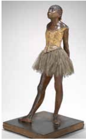
Little Dancer, by Edgar Degas

including the monumental pastel Ballet Scene (c. 1907), monotypes and smaller original statuettes by Degas that are related to Little Dancer Aged Fourteen. The exhibition also includes the oil painting The Dance Class (c. 1873) from the Corcoran ...The [NGA] has the largest and most important collection of Degas's surviving original wax sculptures in the world. Its wax version of Little Dancer Aged Fourteen is the only one formed by the artist's own hands and the only sculpture he ever showed publicly. Degas did not carve sculpture but used an additive process. Little Dancer Aged Fourteen was modeled in wax over a metal armature, bulked with organic materials including wood, rope, and even old paintbrushes in the arms. Degas elevated the sculpture's realism by affixing a wig of human hair and giving his ballerina a cotton-and-silk tutu, a cotton faille bodice, and