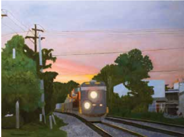
Train Rolling By, by Paul Tambellini