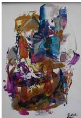
Calagy Artwork for Wine Bottle