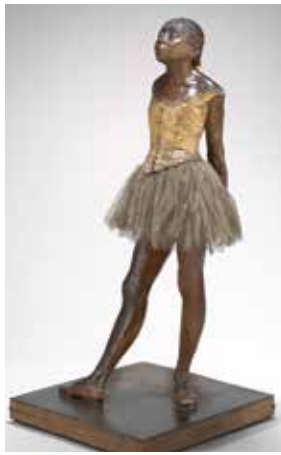
Little Dancer, by Edgar Degas

"Little Dancer Aged Fourteen ...caused a sensation at the 1881 impressionist exhibition center...This exhibition is presented in conjunction with the...Kennedy Center premiere... Little Dancer... Little Dancer Aged Fourteen will be presented with 14 additional works from the Gallery's collection, including the monumental pastel Ballet Scene (c. 1907), monotypes and smaller original statuettes by Degas that are related to Little Dancer Aged Fourteen. The exhibition also includes the oil painting The Dance Class (c. 1873) from the Corcoran ...The [NGA] has the largest and most important collection of Degas's surviving original wax sculptures in the world. Its wax version of Little Dancer Aged Fourteen is the only one formed by the artist's own hands and the only sculpture he ever showed publicly. Degas did not carve sculpture but used an additive process. Little