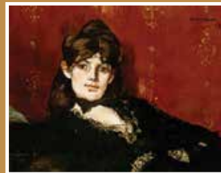
Berthe Morisot, by Manet

"It is important to express oneself...provided the feelings are real and are taken from your own experience." –Berthe Morisot