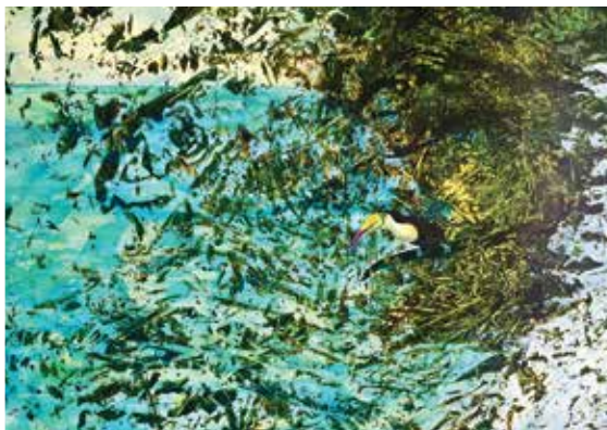
Afternoon Gusts, by Joan Plato

scapes and Other Dreams October 3, 2014- November 1, 2014 Reception -5:00 PM- 9:00 PM, October 4, 2014