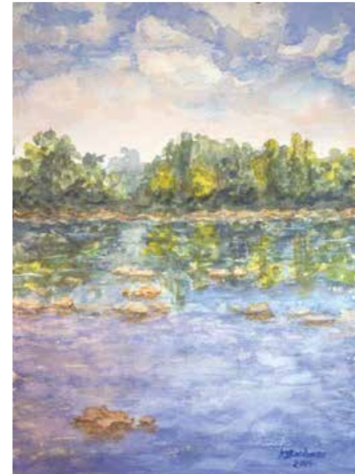
Potomac at Swains Lock