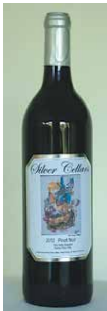
Calagy Wine Bottle