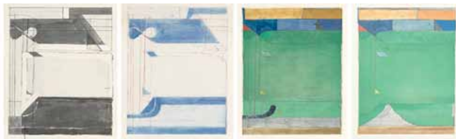
Green (working proof 1), 1986, by Richard Diebenkorn (Yes, No, Maybe)