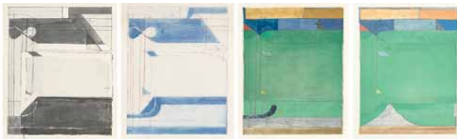
Green (working proof 1), 1986, by Richard Diebenkorn (Yes, No, Maybe)