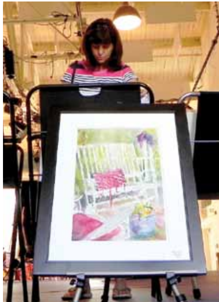
Customer On The Stage