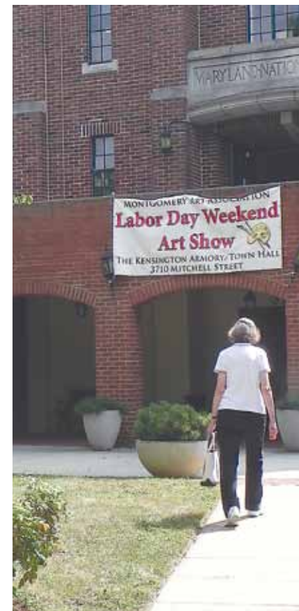
Going To The Show