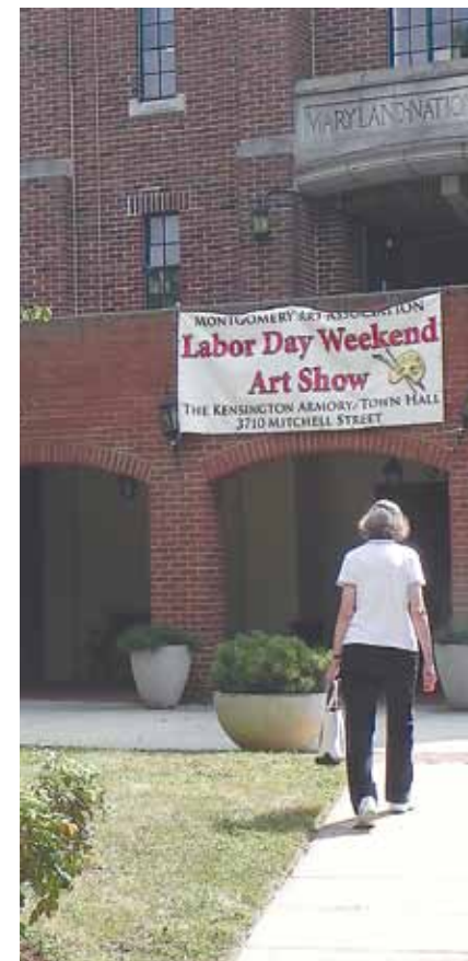
Going To The Show