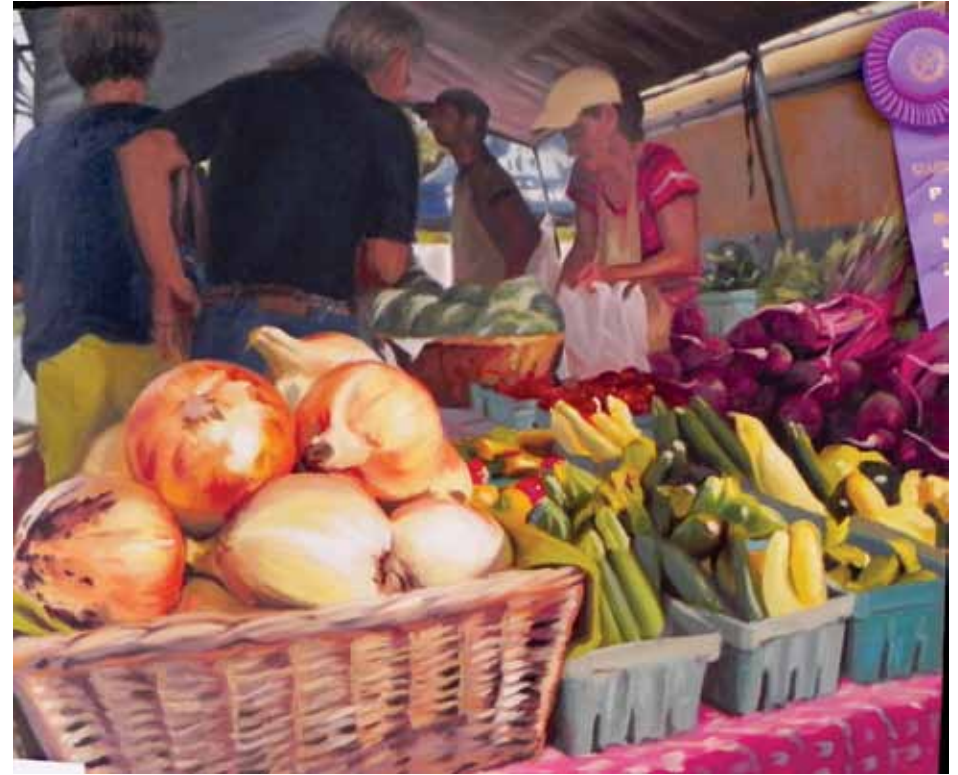
Kensington First Place Winner