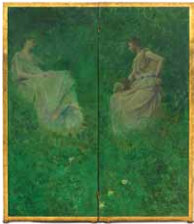
The Four Sylvan Sounds (The Woodpecker and the Wind through the Pine Trees) by Thomas Dewing (1851–1938)

Independence Avenue at Seventh Street SW Information: 202-633-1000 or 202-633-5285 (TTY) This gallery focuses on contemporary artists.