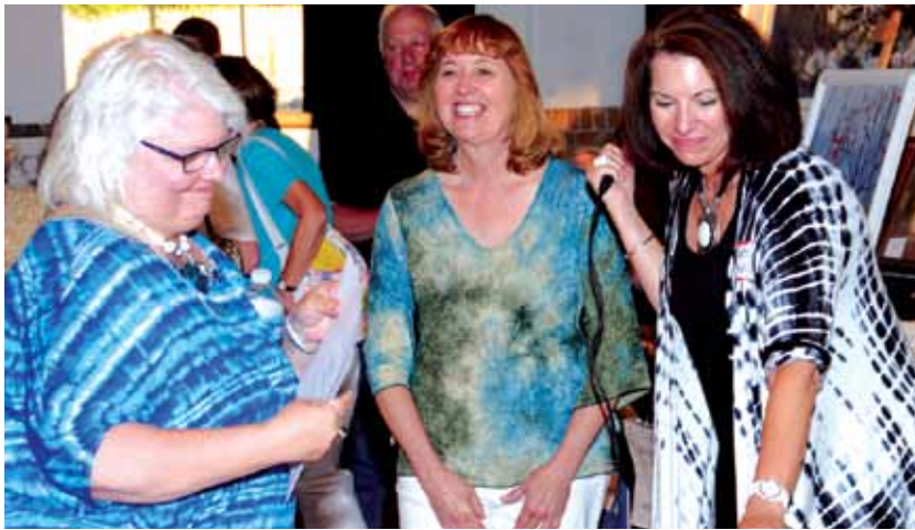
Giving Out The Awards