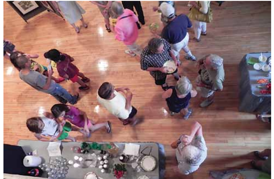
People At The Reception