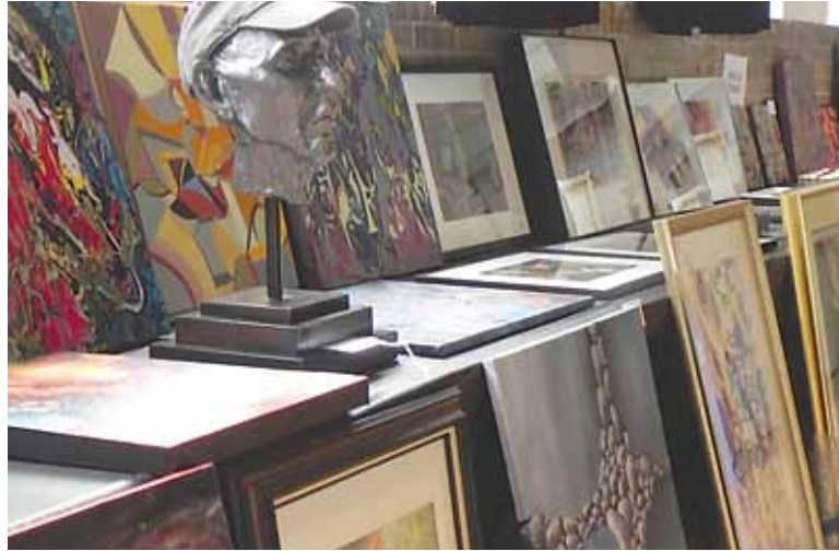
Awaiting The Judge

continues to get better and better. Thank you to all who submitted their work. We had some challenges with the space due to other events being staged in the Armory but that didn't stop our creative members from figuring out how to make the best of it.