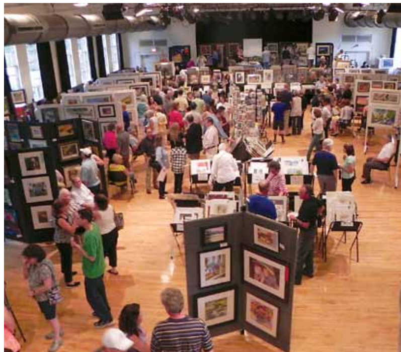
View of the Floor