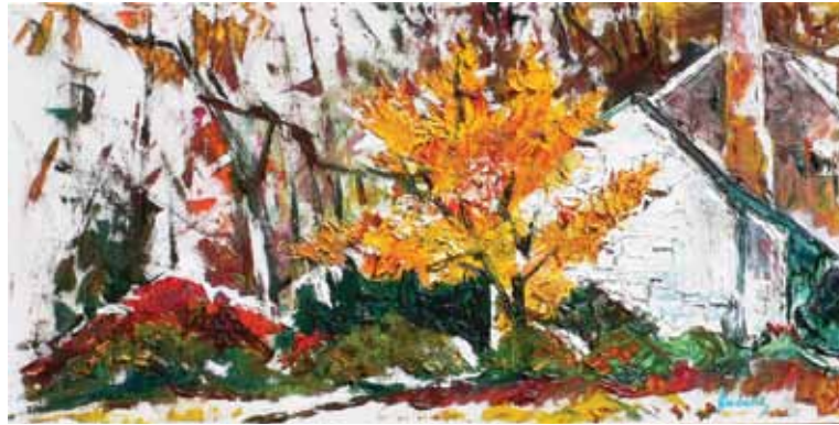
Landscape, by Jacques Bodelle

the natural world. The Bodelles plan to remain in this area but to travel as frequently as possible. Jacques is obviously constantly amazed and inspired by his environ-