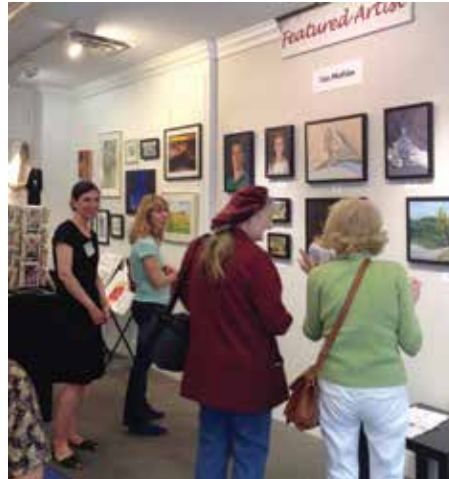
Admiring the Work