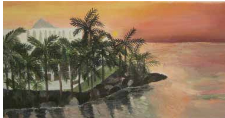
Mt. Lavinia Hotel Sunset, by Indrani Gnanasiri

blocks of color what each of my paint colors look like when mixed with degrees of white, black, gray and cream. This helps me select which colors I'll use in my painting by giving me an idea of what they look like when mixed." She showed me examples of these 'color neighborhoods' which start with the darkest and then she pulls her brush down the paper until the color almost disappears. This lets the artist save the charts and to be able to use groups she especially likes over again without having to keep reinventing all the time. That makes good sense to