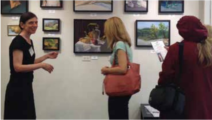
The Featured Artist