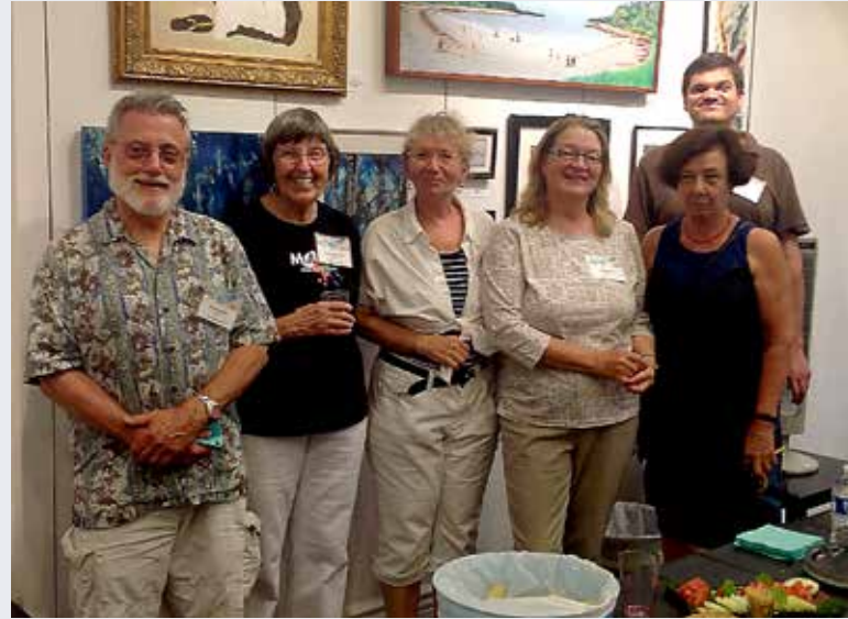
The "Gang" Enjoying the Party