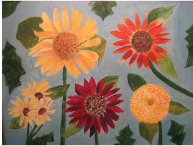
Sunflower Sampler, by Indrani Gnanasiri

Gnanasiri chooses to begin each painting by laying out a type of color chart she calls a shade sheet. This process stems from the color theory class she took at Montgomery College. "I set up what could be called a shade sheet... like doing a color neighborhood to set up the colors I actually want to use. I have charts that show in