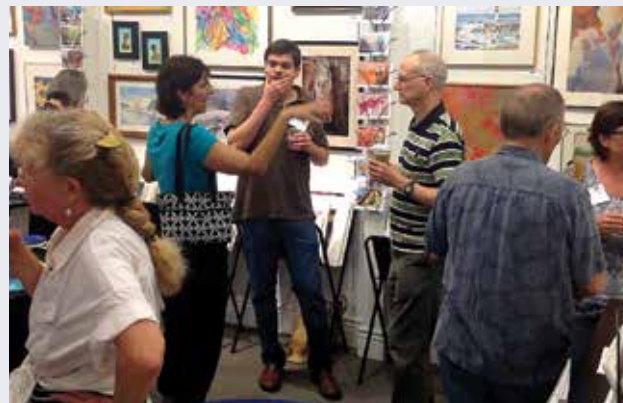
Talking With the Artist