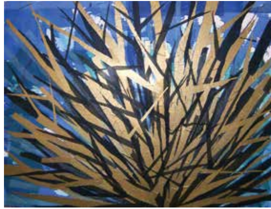
Coral Reef, by Giovanni Scaduto-Mendola

Scaduto-Mendola is currently working with watercolor, acrylics, cardboard ("it is so easy to get!") and balsa. Color is keen and effervescent, brushstrokes sharp and clean, pulling the observer around each work. His painting, Forest Fire doesn't use flames but splashes of bright yellow behind dark strokes that