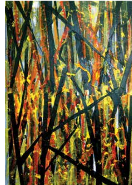
Forest Fire, by Giovanni Scaduto-Mendola

in an explosion of black and gold. Pure red, green, and black organic shapes fill the crowded canvas of Dense Jungle , a single patch of unexpected yellow in the upper right corner giving the viewer a sense of the sun suddenly poking through the crowding sense of foliage and increasing the feeling of a hot and humid space. In "Everglades", Scaduto-Mendola utilizes various shaped cardboard cutouts painted in muted turquoise to evoke clusters of eucalyptus leaves mounted over black branch strokes, against varied blues, the viewer is transported into a sense of the Florida Ever-