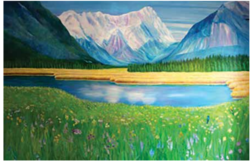
Mountain Mural, by Pam Gordimer

“My art has both realistic and abstract qualities. The pieces are typically based on some form of nature and the landscape, reflecting my time growing up in the country’s heart-