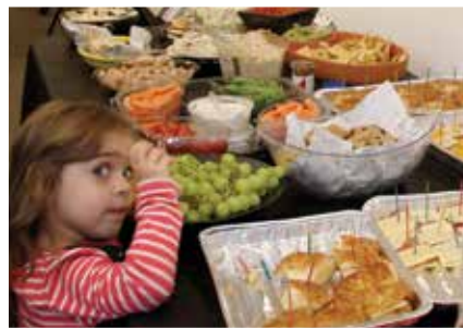
Enjoying the Food