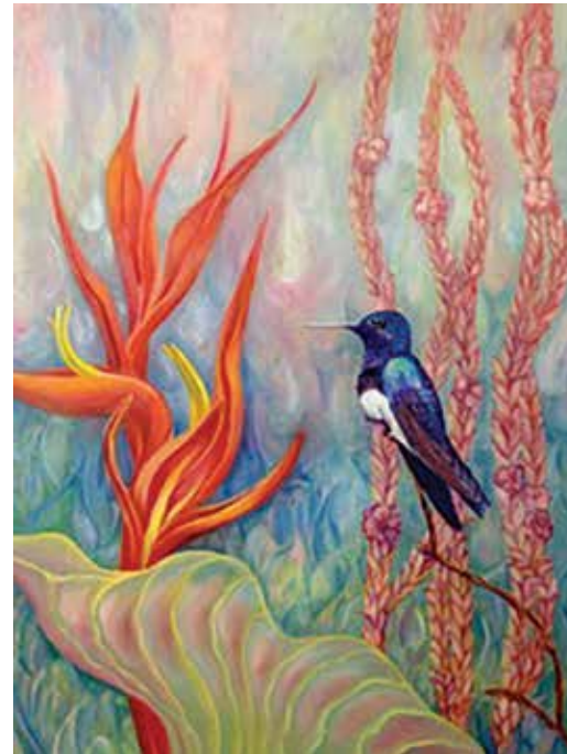
Hummer's Dream, by Pam Gordimer

land. The simple beauty of the prairie made me look closely at light and shadow, and their effects on the landscape throughout the changing seasons.”