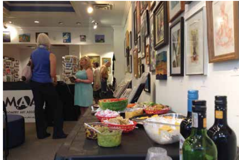
Birdseye View of the Food