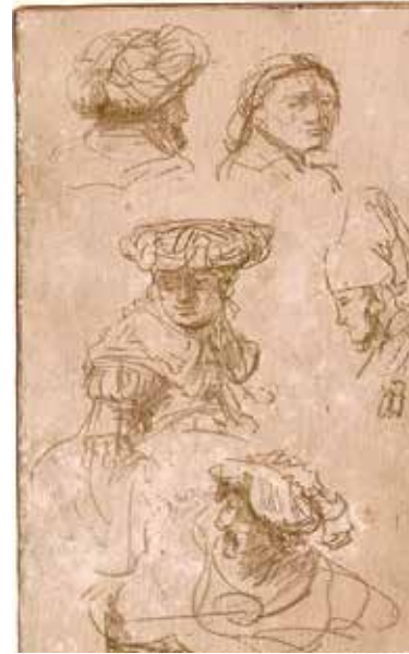
Rembrandt van Rijn, Five Studies of Heads, c. 1633, ( silverpoint on prepared vellum)