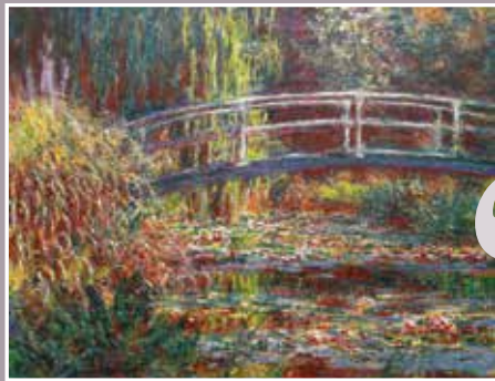
The Water Lily Pond, by Claude Monet

The deadline for submissions for the August newsletter is July 20.