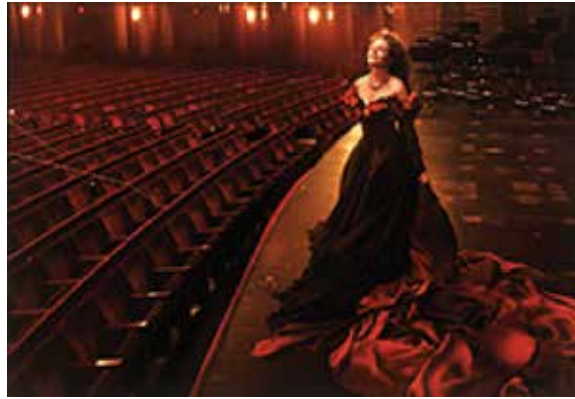
Renée Fleming on stage, from Eye Pop (NPG)

8th St. at F St., NW, Washington, DC 202) 633-1000 (voice/tape) The National Portrait Gallery (NPG) and the Smithsonian American Art Museum (SAAM) both contain many permanent exhibits that easily allow for many visits. These two connected galleries, which are part of the Smithsonian Institute, form a national