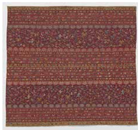
Colonial Inka woman's manta (shawl), 1780-1800.