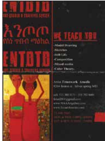
Postcard for Entoto Art Studio and Training Center