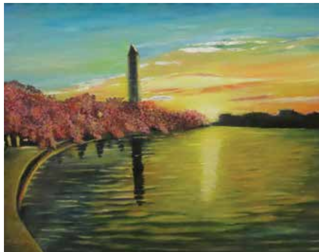
Sunset by the Cherry Blossoms, by Nassera Dahmani

First day of show—Tues, 12/8; Last day of show—Sunday, 1/2