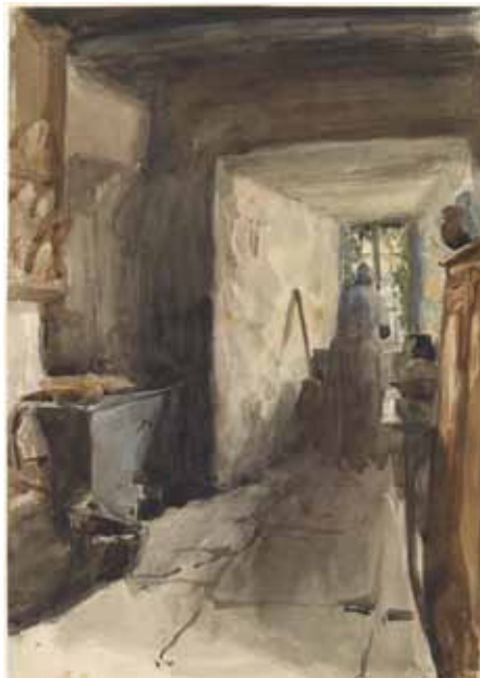
From Off the Beaten Path, James McNeill Whistler