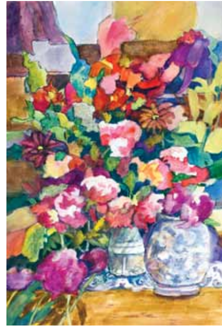
Toward The Light, by Carol Bouville

I looked at a painting of a market she had visited in Ghana and felt a connection with the women in the market place. The exquisite African fabrics