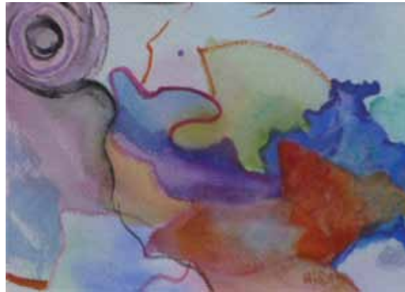
Calcutta Whimsey, by Cathy Hirsh

If you are interested in having your work included in MAA News , please send one or two high-resolution (300 dpi) jpegs to nmfalk@comcast.net . Please label your submissions with the title and your name.