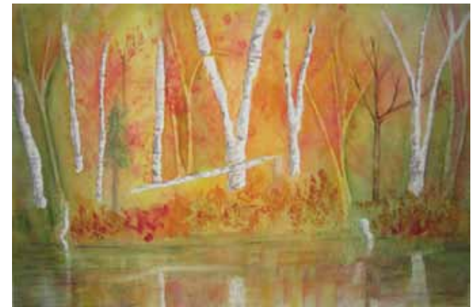
Untitled, by Sandy Cepaitis

If you are interested in having your work included in MAA News , please send one or two high-resolution (300 dpi) jpegs to nmfalk@comcast.net . Please label your submissions with the title and your name.