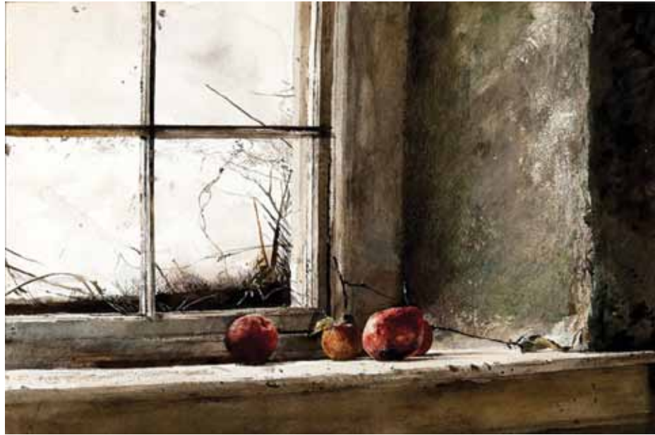
Frostbitten, by Andrew Wyeth

The Corcoran has chosen to rehang 110 of its pre-1945 collection. The exhibition will be divided into 4 areas, Pride of Place: The New Nation , "The Lure of Paris" , "New York in the New Century" , and "Beyond Borders: Modernism" . The gallery is also