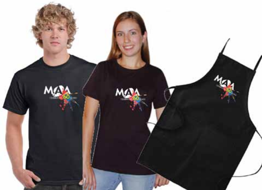
MAA 60 Year Anniversary t-shirts and aprons are now on sale.