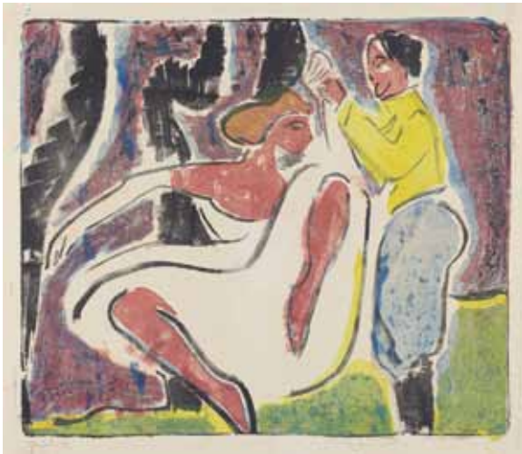
Ernst Ludwig Kirchner, German, 1880–1938, Russian Dancers, 1909. Modern German Prints and Drawings from the Kainen Collection

Recently gifted to the museum and one of his best known paintings, Wyeth's Wind from the Sea (1947), was chosen as the centerpiece of this 60 works show. Wyeth has used windows repeatedly throughout his long career. Though often thought of as a very representational painter, he has stated that he works as an abstract artist. I hope the attendees will be able to understand this after seeing these masterworks.