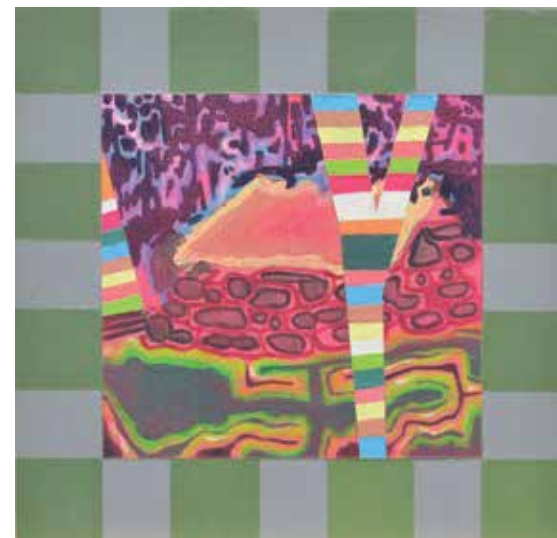
Ruminate My Rainbow Tree, by Randall Lear

(Common Ground Gallery) March 27, 2015-April 26, 2015 Opening Receptions: April 3 - 7:00, to 9:00 PM - 7:00 PM- 9:00 PM °