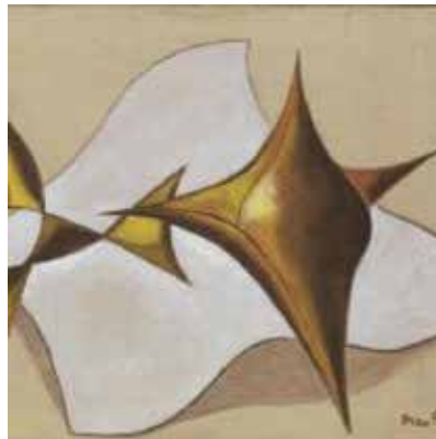
All's Well That Ends Well, by Man Ray

Feb 7, 2015-May 10, 2015 Both artists explore the relationship between art and mathematics. Ray looks at how 3 dimensional objects are turned into 2 dimen-