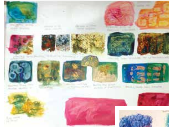
Above and right: Texture Samples