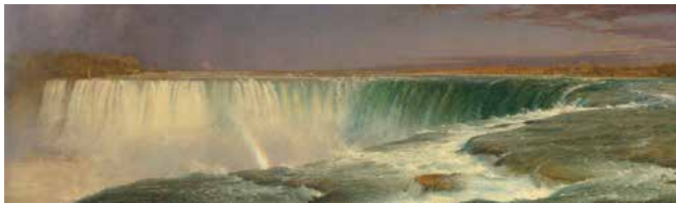
DETAIL: Niagara, by Frederic Edwin Church, (American Masterworks from the Corcoran)

950 Independence Avenue, SW Washington, DC (202) 633-1000