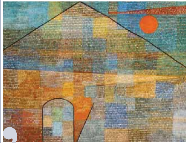
Ad Parnassum, by Paul Klee

The deadline for submissions for the April newsletter is March 20.