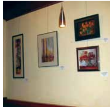
MAA artists display at Amici Mei