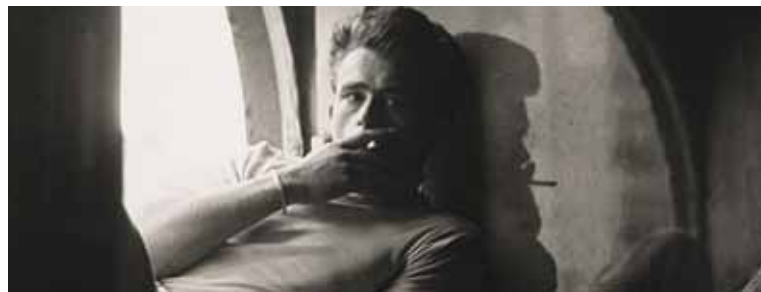
From "American Cool"