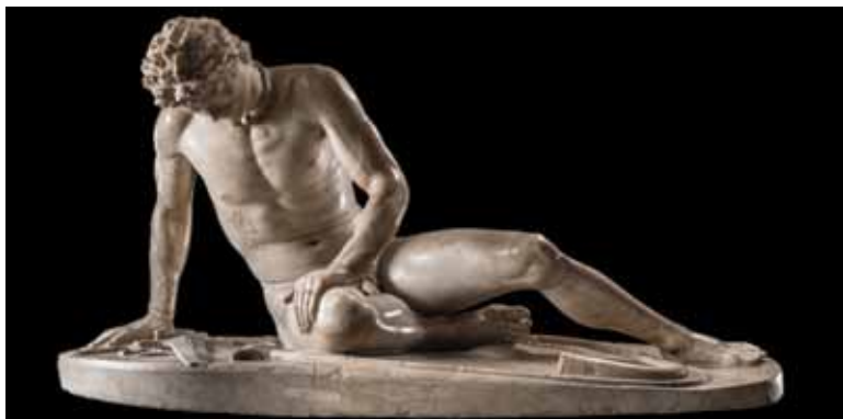
The Dying Gaul