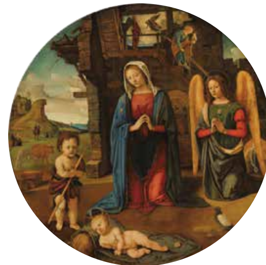
The Nativity with the Infant Saint John, Pietro di Cosimo

Intersections, a series of projects explores the way two, sometimes radically,