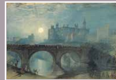
Alnwick Castle, by J.M.W. Turner

The deadline for submissions for the March newsletter is February 20.