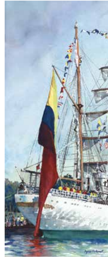
Tall Ship Gloria