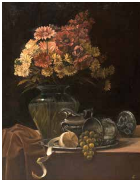
Still Life with Lemon, by Galina Kolosovskaya

the whole or parts of feathers. These gorgeous works are a feast for the eye. She carefully cuts the feathers as needed. Next she arranges them on the paper (sometimes using watercolor or air brush for background) to make fantastic images of flowers, butterflies and birds. If you check out her website, featherart.org, you can see her as she demonstrates the making of one of her feather art pictures. Kolosovskaya said, "I try to find harmony between the images and the colors and textures of the feathers. People tell me they feel very relaxed...calm [looking at my feather art]. Some of my students