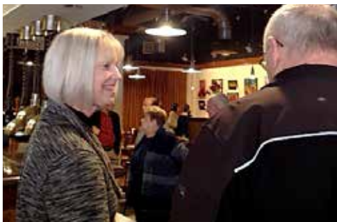
Above right & above: Reception at Amici Miei