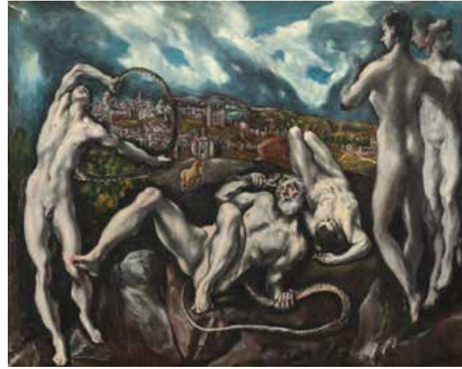
Laocoön, c. 1610/1614, by EL GRECO

January 11, 2015 Neo-Impressionism, which included Georges Seurat, Paul Signac, and Theo van Rysselberghe came into existence about 1886 providing an alternative to Impressionism. By 1890 and linked with the Symbolist movement it sought to take painting from an outer to an inner vision of the artists, writers and musicians' lives. pictures that accentuate subjectivity and an inner world of experience, approaches they shared with their contemporaries, painters, writers, and composers in Paris and Brussels. More