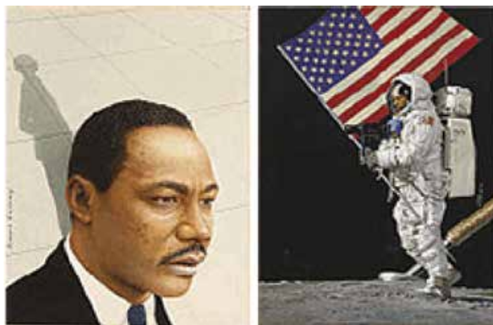
Time Covers from the Sixties

1250 New York Avenue, N.W., Washington, DC 20005-3970 202-783-5000, 1-800-222-7270