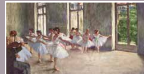
Ballet Rehearsal, by Edgar Degas