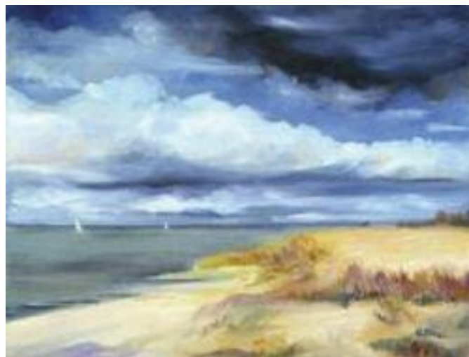
Beach and Sky, Nar Steel