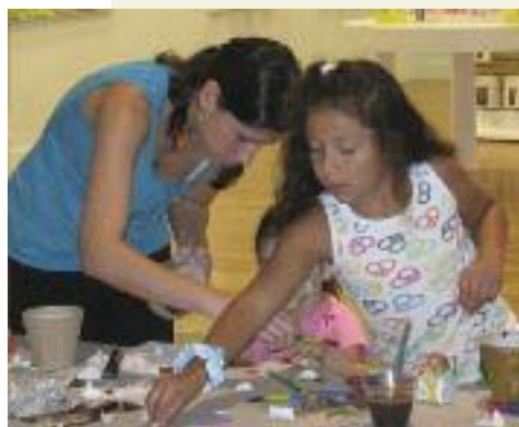
Children Enjoy the MAA Kid's Table At Westfield Wheaton Mall on Family Day.