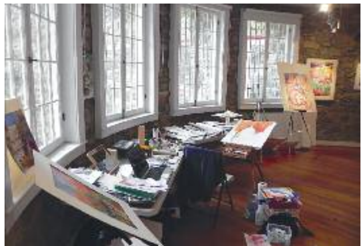
Top: Exterior of the Stone Tower Above: Light streams in