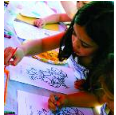
Kids Paint At Olney Market