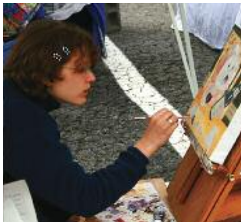
Artist at work